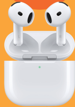
AirPods 4 1 winner