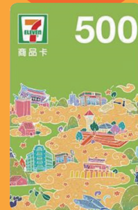
7-11 NTD$500 gift voucher The first 100 respondents to complete the survey