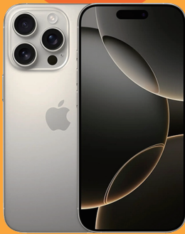
iPhone 16 128G 1 winner