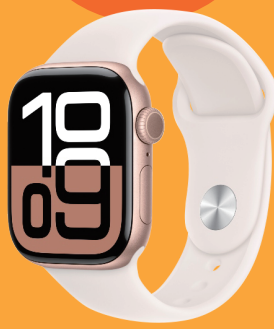
Apple Watch S10(42mm) 1 winner