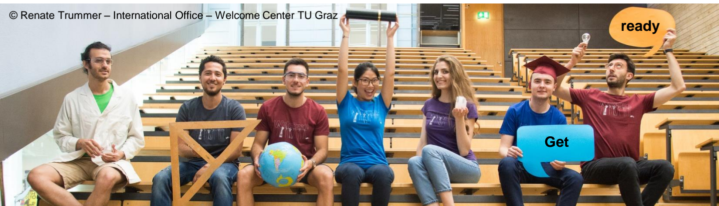
© Renate Trummer – International Office – Welcome Center TU Graz