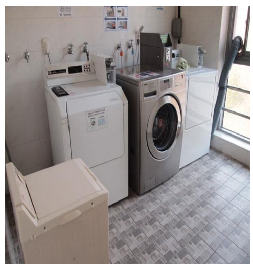
\Laundry Machine and Dryer\\ * KRW 1,000 per use